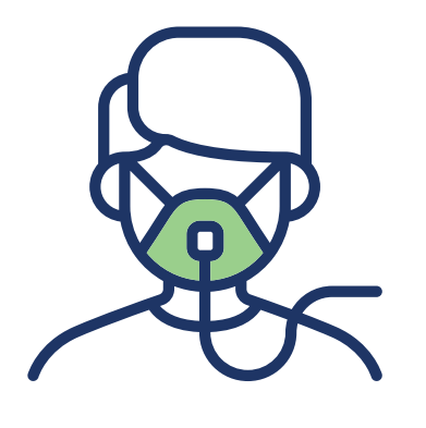
Respiratory Fit Testing